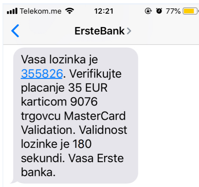
Picture 4 - SMS with OTP