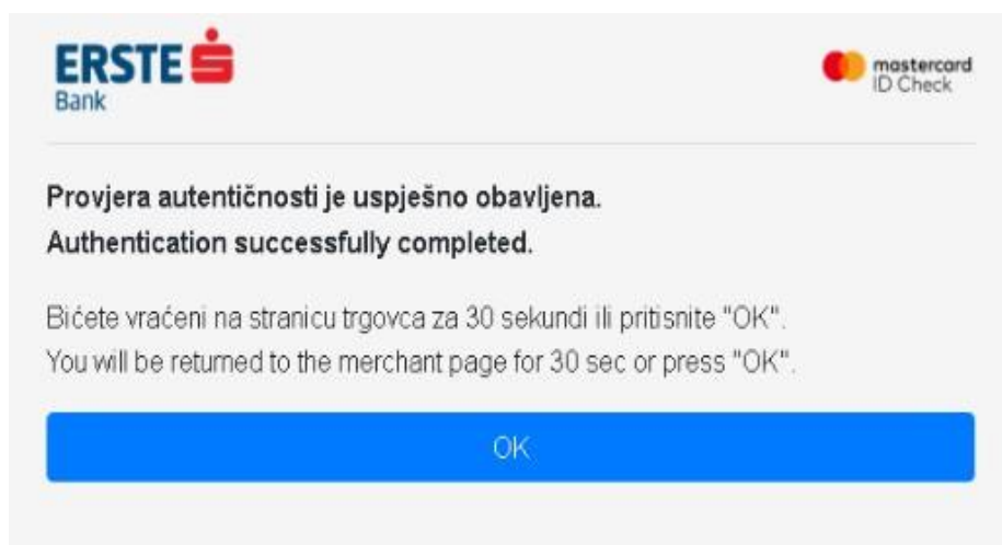
Picture 5 - Information about successfully completed transaction authentication