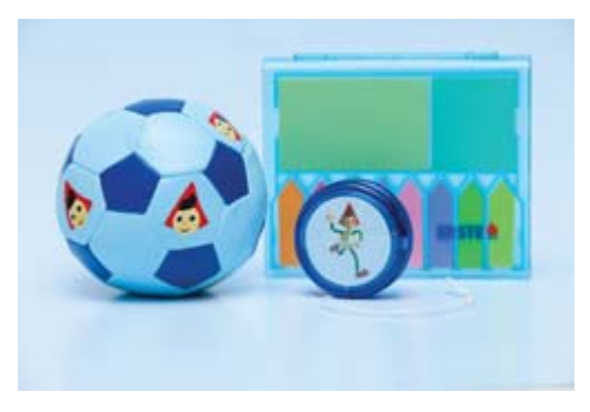
Download [jpg; 384.3 KB]

Additionally, a special World Savings Day premium savings passbook will be on offer from 17 October to 4 November 2011. The terms: 3.00% p.a. interest in the first year ; maximum deposit per quarter: EUR 1,500. After the end of the first year, "s Prämien Sparen" deposits will bear standard interest rates as applicable at the time.